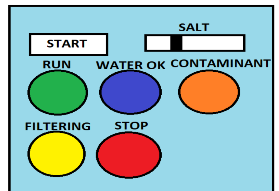
Fig 1.3 DeltaV I/O, SFC and Graphics