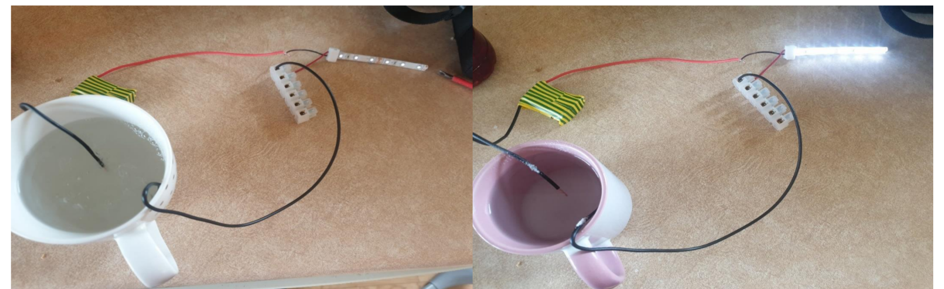
Fig 1.2 9V circuit submerged in water samples