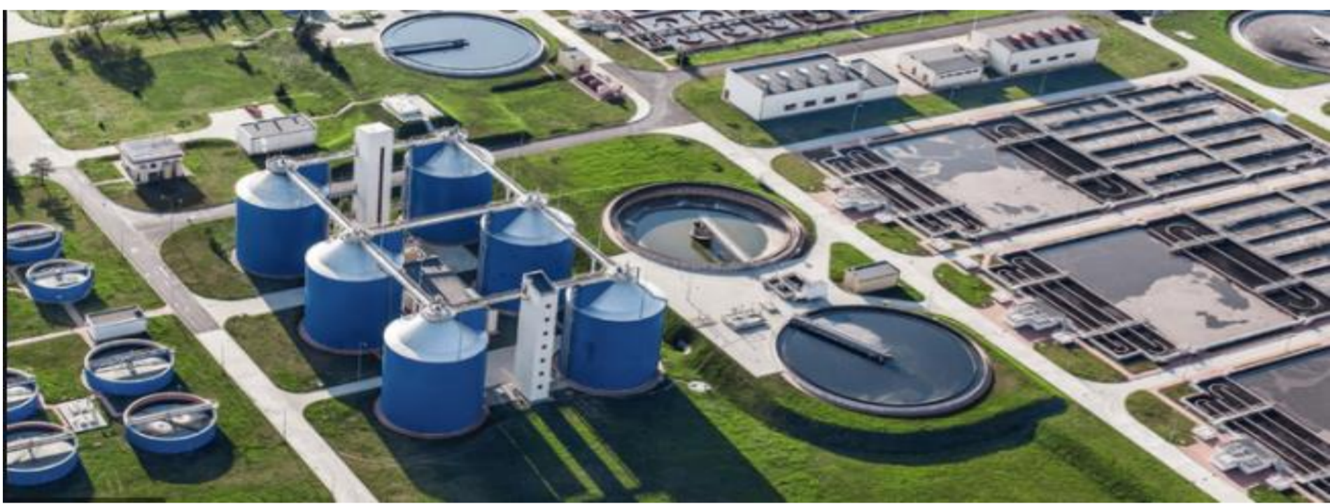
Fig 1.0 Waste water treatment plant