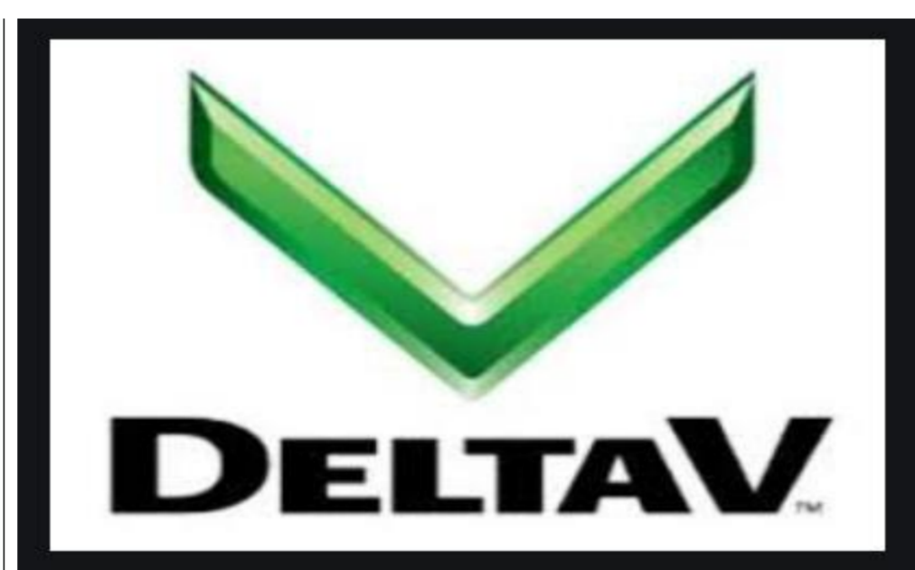
Fig 1.1 Emerson DeltaV